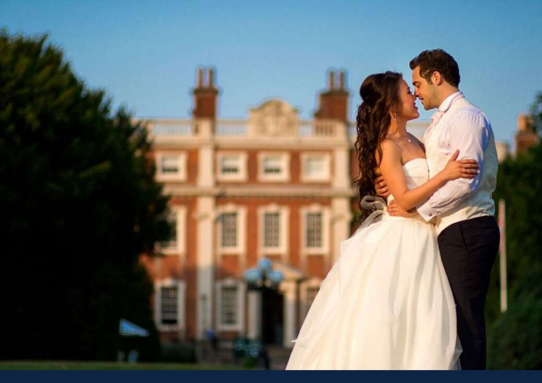
Weddings at Swinfen Hall